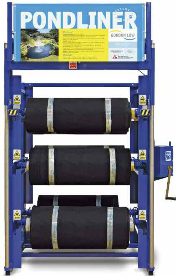
Safeload Mechanical Roll Stand stocked with six rolls of half width Greenseal Pond Liner.

Our Mini Roll Stand stocked with three 20m rolls of Greenseal and a roll of underlay.