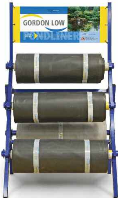
Mini Roll Stand with three half width rolls of Firestone PondGard and a roll of underlay.