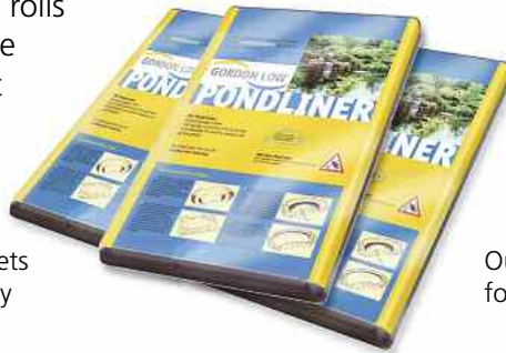
PVC pre-packed sheets for open shelf display

The full range of rolls and pre-packs are available on next day delivery.