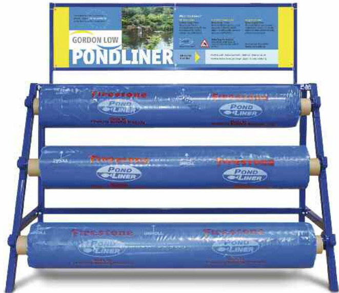
Large Roll Stand with three full width rolls of 30.48m (100') Firestone PondGard.