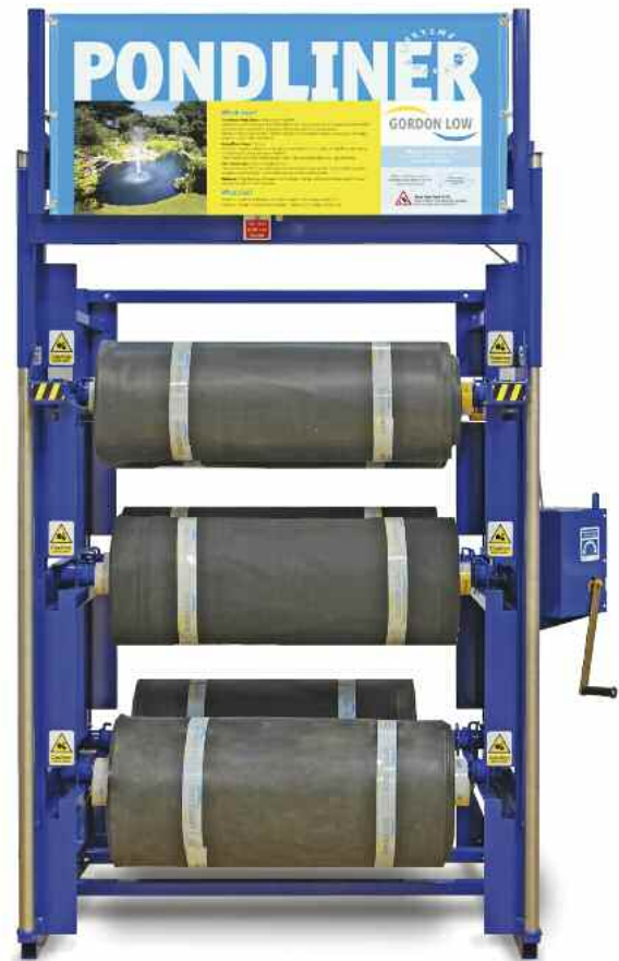
SafeLoad Mechanical Roll Stand stocked with six rolls of half width Firestone PondGard.

Firestone Building Products follow stringent quality control guidelines. The company's EPDM manufacturing facilities have received ISO 9002 certification for their total quality management principles and ISO 14001 certification for their environmental management system. Firestone PondGard is guaranteed to be compatible with aquatic life in accordance with testing reports published by the Water Research Centre.