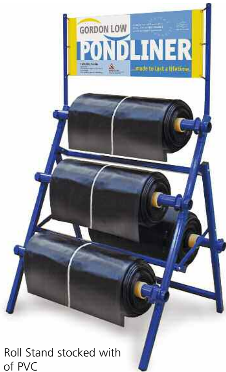
Our Mini Roll Stand stocked with four rolls of PVC