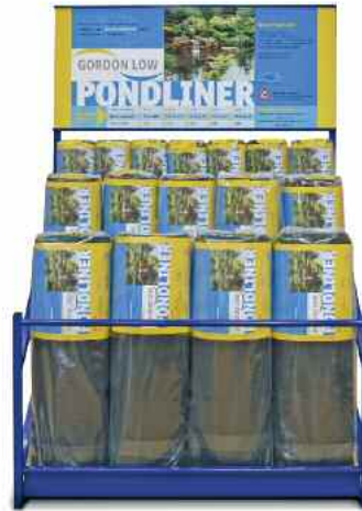
Pre-pack stand loaded with a selection of Greenseal pond liners.

The table below lists a small selection of available sizes from our range. Our largest sheet in one section is 1800m 2 .